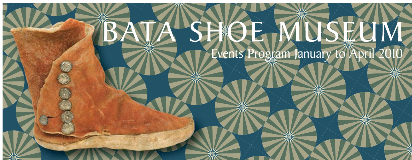
Navajo boot, Arizona, 1900-1933